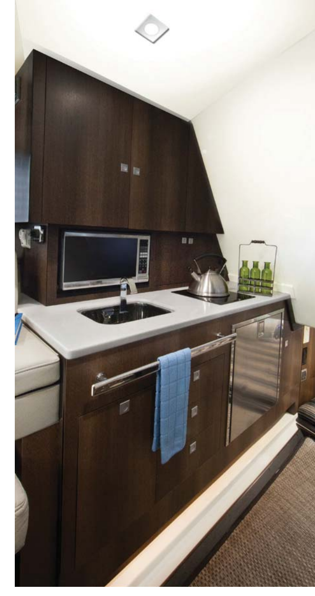
The fully equipped galley in the 360SC is to starboard. Note the entry to the aft cabin.

The Monterey 360 SC is a great example of a stylish and functional mid-size express cruiser with ample room for entertaining crowds on a day trip, yet still comfortable enough for cruising. If you're looking to spend quality time on the water with family and friends while surrounded by luxuri-